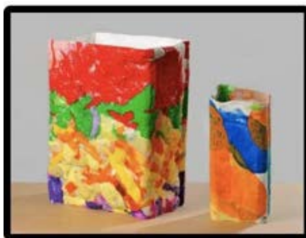
Art Products designed with recycled materials and exhibited through the “Art, plastic and recycling”.